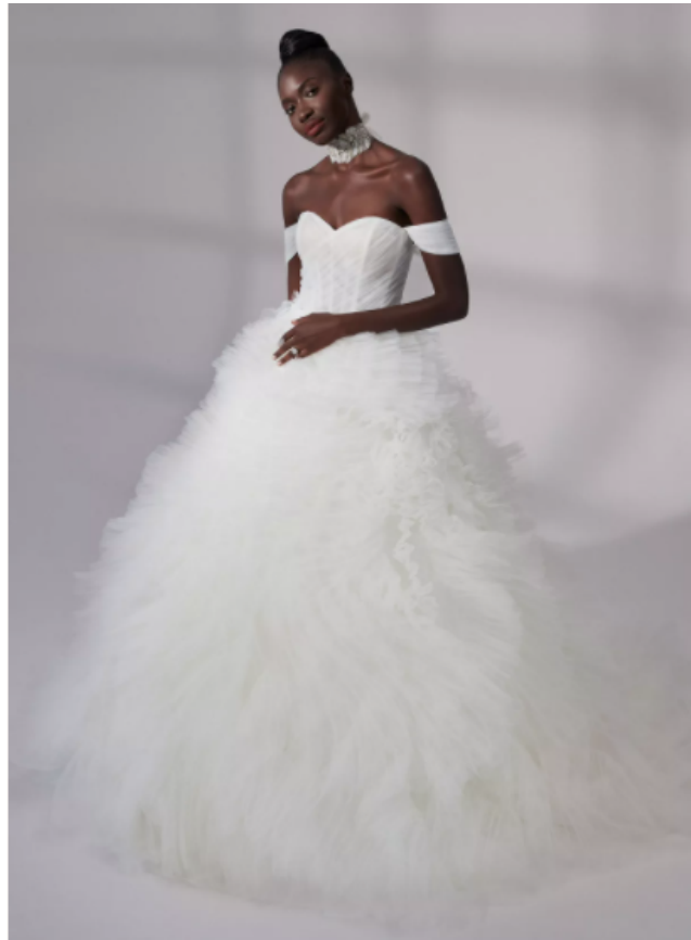
4. Ball gown Ruffles skirt